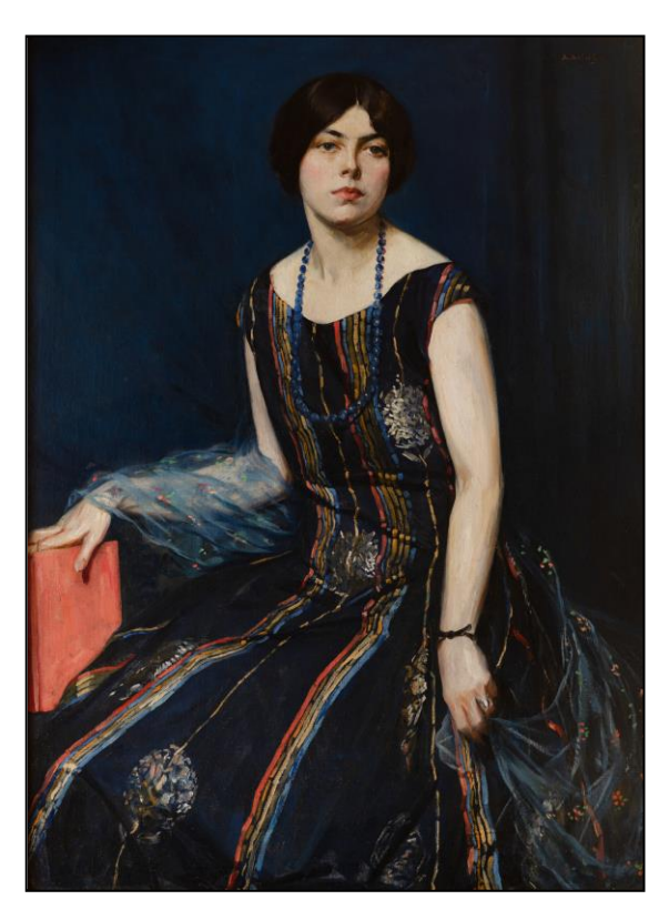
Maurice Molarsky (1885–1950) Portrait of a Young Woman Holding a Red Book, circa 1915 Oil on canvas 50 1/2 x 35 inches Collection of Sandra & Bram Dijkstra

But a counter-cultural movement to this "idealization" of anti-feminine attitudes also began to develop at this time. The "individualizing" quality that had begun to creep into the "idealized" portraits of women in the work of painters such as Ballin, Lionne, and even Berneker, came to be incorporated more and more frequently into the actual portraits of women painted during the mid-l9l0s by otherwise still quite traditional artists. The American painter Maurice Molarsky (1885—1950), an immigrant from Russia, was among those who were able to "shake themselves free of the fetters of prettiness and sentimentality" Charles Caffin had seen as dominating too much of early twentieth-century American art. Clearly Molarsky did not participate in the movement away from "character," that "functional degradation" of their female subjects which Caffin abhorred in the work of the Gilded-Age Europeans.