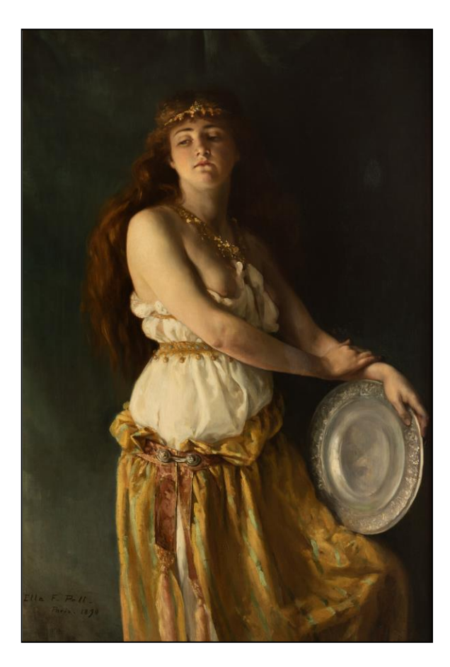
Ella Ferris Pell (1846–1922) Salome, 1890 Oil on canvas 52 x 34 inches Collection of Sandra & Bram Dijkstra

an evil creature, but rather to emphasize that behind this young woman's always so eagerly emphasized "evil nature" stood, at least as far as she was concerned, the figure of a simple—and probably indigent—model who had, most likely, only recently arrived in Paris to try to earn some money. In other words, Pell's "Salome" becomes a subversive proto-feminist statement for its time, precisely because she took the period's favorite male-constructed fantasy of a demonic female and turned it into the portrait of a real woman.