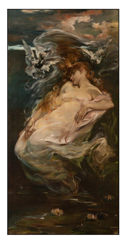
Walter Shirlaw (1838–1909) Dawn, circa 1886 Oil on canvas 66 x 33 inches Collection of Sandra & Bram Dijkstra

This is, in fact, also true of a painting such as Walter Shirlaw's dramatic 1886 Dawn . Initially, one might assume that it places its female subject in a fantasy world typical of the period. After all, Shirlaw (1839—1909) painted this work only a few years after Bouguereau 's equally idealized—and similarly titled—rendition of a female figure floating down toward the lily-leaf-covered surface of a pond, a painting he exhibited at the Paris Salon of 1881. Bouguereau's L'Aurore ( Dawn ) showed an elegant, and quite naked, young woman, who is presumably floating and yet held quite upright in the clear morning air. She is shown in absolutely static suspension, even as a thin gray-white, diaphanous wrap that covers only her legs and one of her arms wafts fiercely about her, agitated by an otherwise apparently non-existent wind. Her hair floats darkly around her head as she reaches over to sniff at a very long-stemmed lily, her toe almost touching the water's mirror-like surface, which, as any well-informed viewer of that period would know, represented the fluid, volatile, watery essence women were supposed to personify.