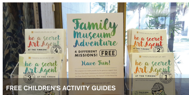
FREE CHILDREN'S ACTIVITY GUIDES