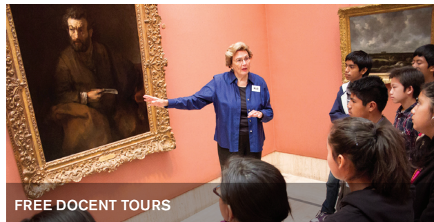
FREE DOCENT TOURS

The Timken Museum of Art offers more than 15 programs principally financed by our members. Here are some of those.