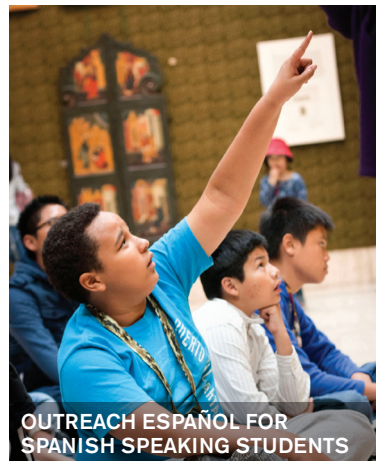
OUTREACH ESPAÑOL FOR SPANISH SPEAKING STUDENTS

The Timken Museum of Art offers more than 15 programs principally financed by our members. Here are some of those.