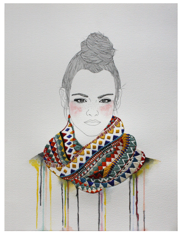
4<sup>th</sup>-12<sup>th</sup> grade example with collage: The scarf symbolizes fashion and the drips represent rain.